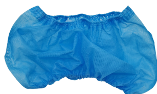
PP OVERSHOE SKU: 7222B COLOUR: BLUE