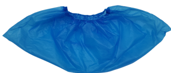
CPE OVERSHOES SKU: 7220B COLOUR: BLUE