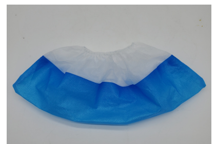
DELUX OVERSHOES (CPE + PP) SKU: 7223BW COLOUR: BLUE & WHITE