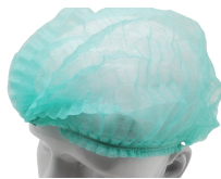
SKU: 7205 COLOUR: GREEN