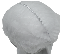
SKU: 7211 COLOUR: WHITE