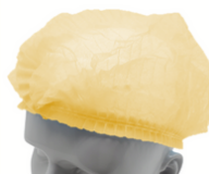
SKU: 7204 COLOUR: WELLOW