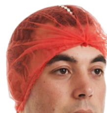
SKU: 7212 COLOUR: RED