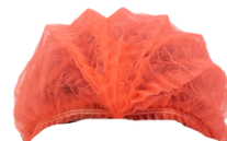
SKU: 7202 COLOUR: RED