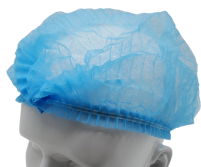
SKU: 7206 COLOUR: BLUE