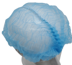
SKU: 7216 COLOUR: BLUE