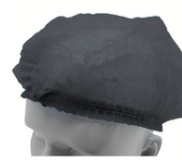
SKU: 7203 COLOUR: BLACK