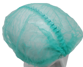
SKU: 7215 COLOUR: GREEN