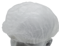
SKU: 7201 COLOUR: WHITE